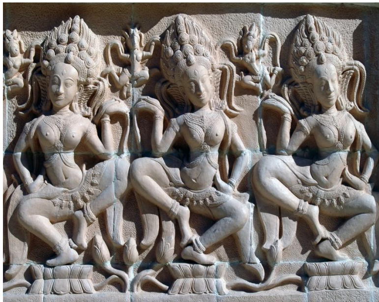
“Indian Stone Carving”